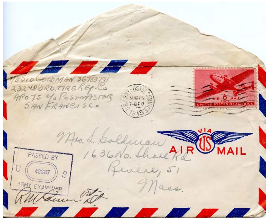
Figure 1: Letter 6, envelope.